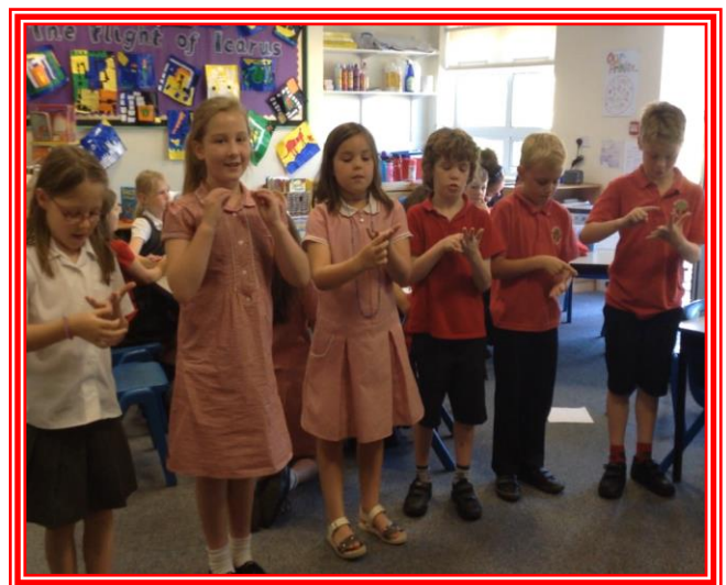
Deaf Awareness Day