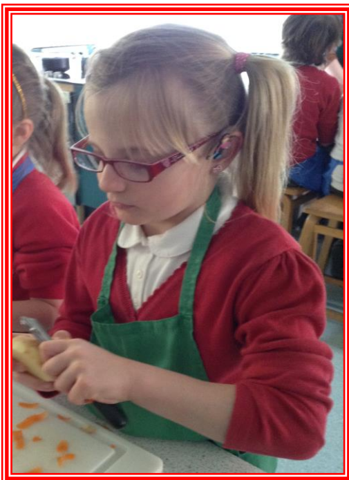
Visits to Middlewich High School