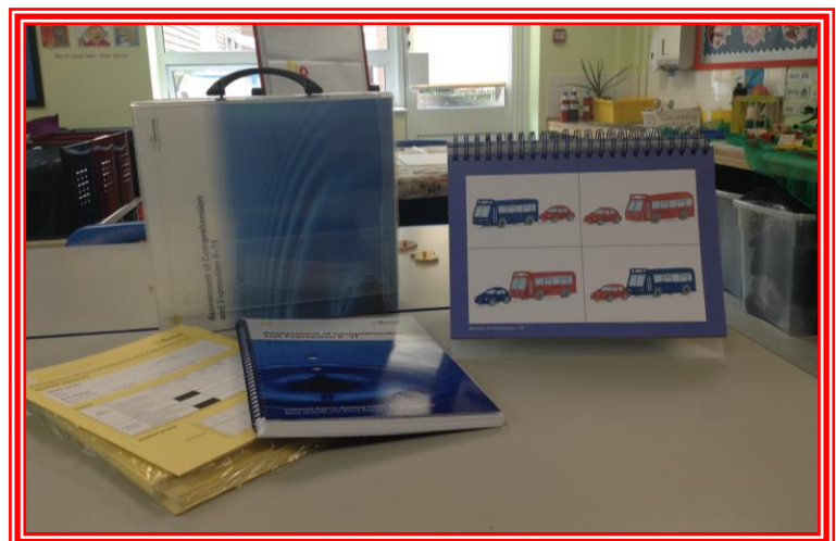
ACE Language Assessment